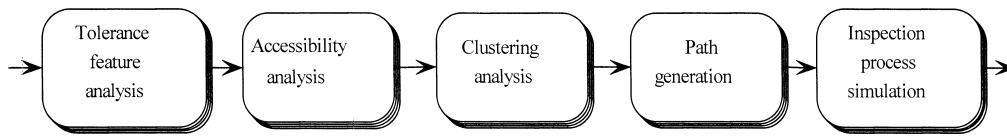
Fig. 1. Flow chart of integrated applications of the developed system.