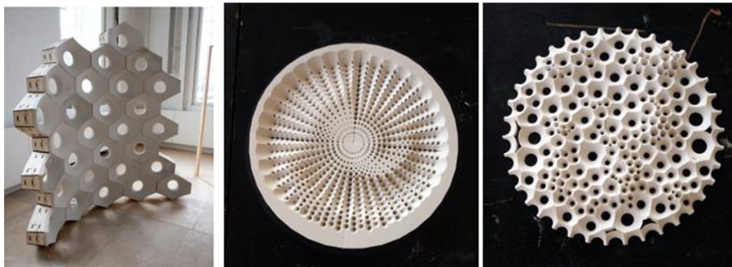
Fig. 2. The full scale prototype wall (left) and 3D printed test panels at 1:10 (right) from Responsive Acoustic Surfaces at Smart geometry 2011.

Fundamental to architectural projects is a requirement for the clear and consistent flow of information in a 'downstream' direction. This follows a chronological project sequence from early design proposals,