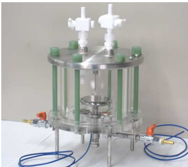
Figure 3. Photograph of main chamber.

The combustible gases were measured both from oil sample and from gas space above oil sample each other. And the total combustible gases were calculated as the sum of two parts.