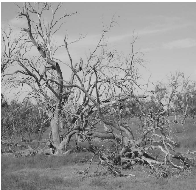
Fig. 1. Trees dying due to the saline coming from the underground water in Pyramid Hill, Victoria.

The schematic of the stationary test system is demonstrated in Fig. 4.