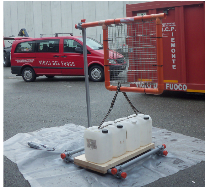
Fig. 1. Target used for experimental test.