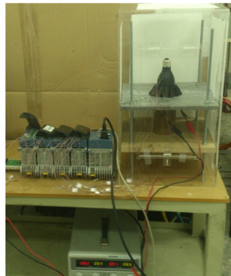
(b) Physical photo