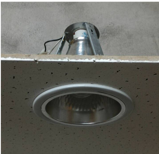
Fig. 1. Installation diagram of LED lamp embedded in the ceiling.

By reviewing the previous literature on closed-cell porous metal medium, most were focused on effect of the program (e.g., cooling rate) and additions (e.g., manganese) on the mechanical properties, or internal cell shape, size and porosity of closed-cell porous metal medium under static or dynamic load or different strain rates on the mechanical