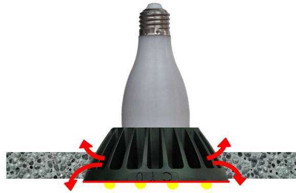
Fig. 2. Schematic diagram of heat transfer for LED lamp embedded in the closed-cell aluminum-foam ceiling.