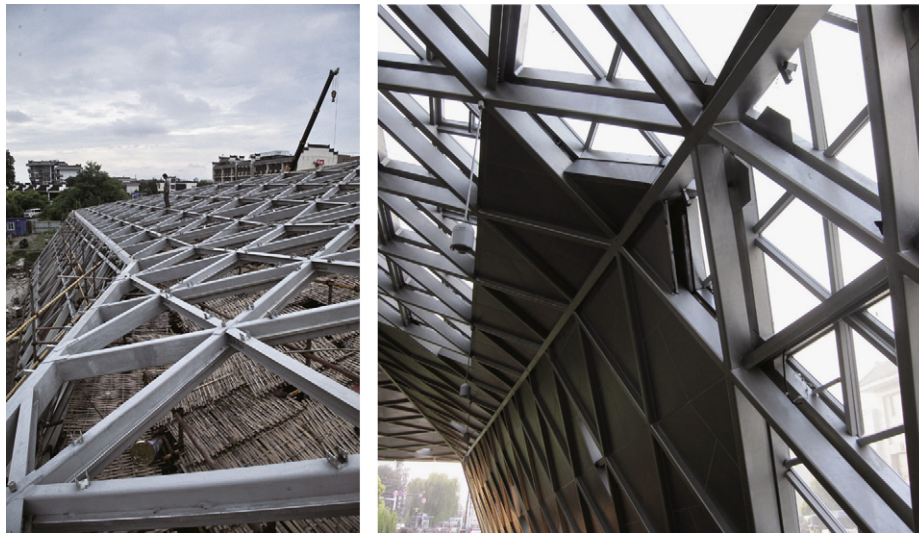
Figure 1 Structure of the shell.

In order to simplify issues, an abstract geometrical model is introduced to describe the building structure as a whole, with beams and nodes turned into abstract line segments