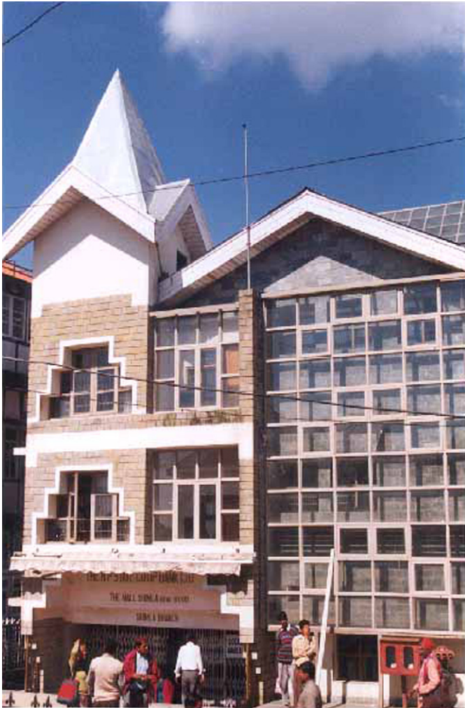
Fig. 1. Passive solar State Co-operative Bank building at Shimla.

temperature at 19 °C, heats the air which is circulated by a fan through ducts into the banking hall and conference room.