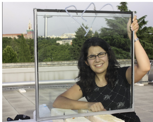
Fig. 1. Transparency of the glazing.

Various researchers have developed test methods to evaluate heat gain and heat loss in indoor spaces, and more specifically in the field of the energy efficiency of different types of glazing. Grimmer states that small test boxes can be a very useful tool for the thermal modelling of buildings [16]. Álvarez, Palacios, and Flores developed a test method to measure the thermal performance of glazed windows [17]. They propose a laboratory-developed procedure that lets any glazing composition be compared with another. Around 1990, the Lawrence Berkeley National Laboratory (LBNL) of the University of California (USA) developed a mobile system for