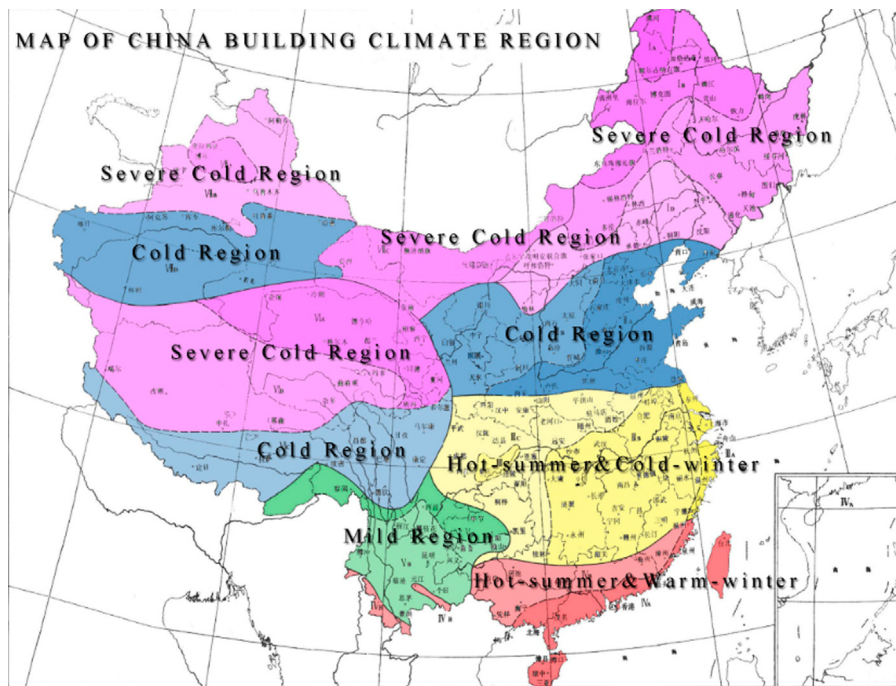
Fig. 1. Map of China building climate region.

region, distribution of them in China is shown in Fig. 2. For courtyard in China cold region, it adopts the layouts of “Opening to sky and Surrounding by wall”. In national psychological culture, it interprets Chinese introversion and implication and traditional ethical code (Chen, Ya, & Wang, 1997; Wang & Liu, 2002). Furthermore, in combination with nature, it balances day lighting and natural ventilation, so these methods provide many evidences and directions for courtyard to obtain a good light and wind comfort.