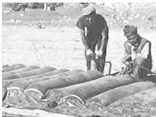
Fig. 1 Solar sacks

normally in winter. Due to the specific climate and geographic characteristics, the ice regime has its unique characteristics. For the obvious diurnal variation of ice formation and melting, the stable ice cover can not be formed and the main ice form is the suspended ice crystal, resulting in difficult ice control measures. At present, the traditional ice control measure is to cover the channel with the concrete plate, but its cost is high and it is difficult to clean the silt when the channel is jammed by ice.