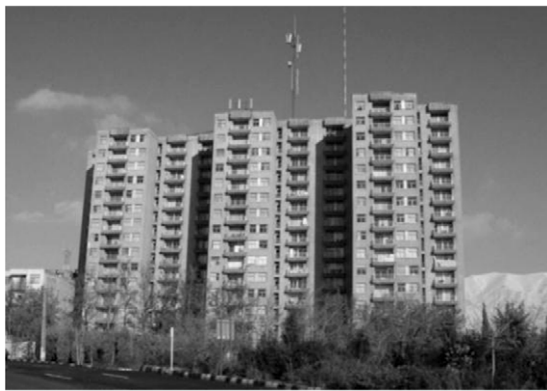
Fig. 2. The southern view of the building.