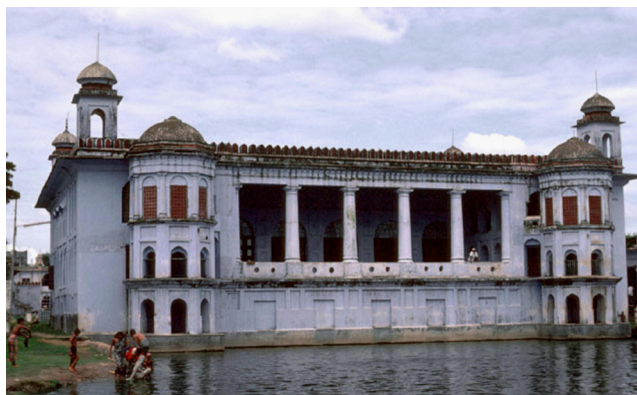
Figure 3 Hussaini Dalan in 1982.