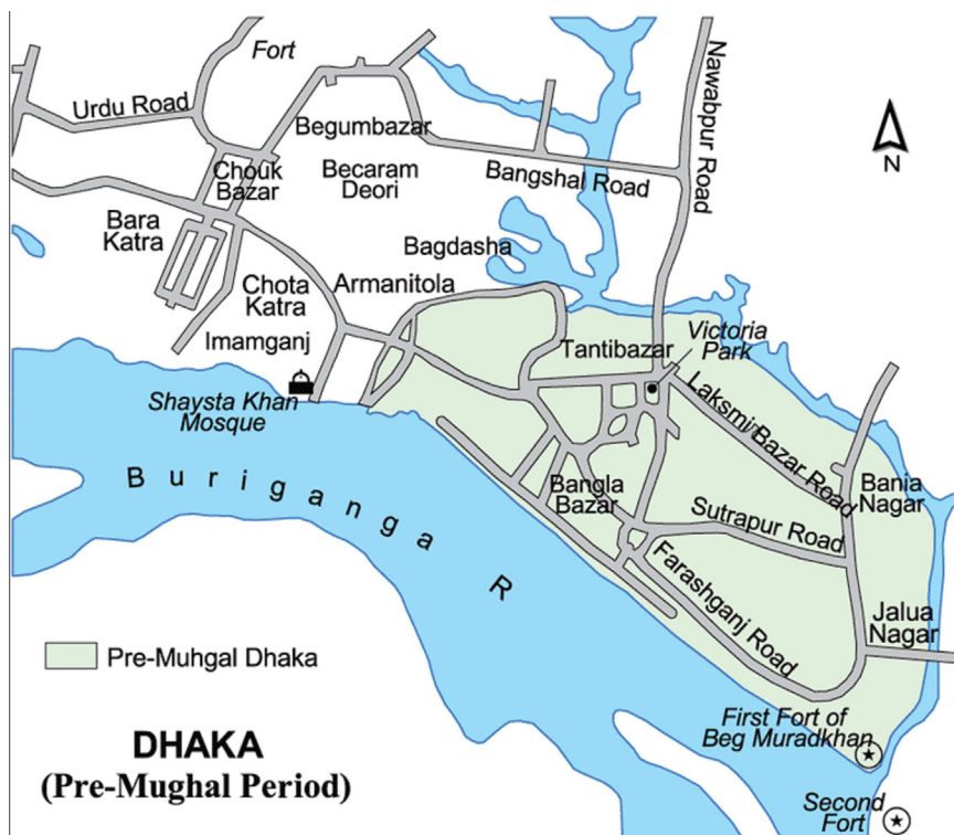
Figure 1 Pre-Mughal Dhaka. Source: Islam, 1996b.