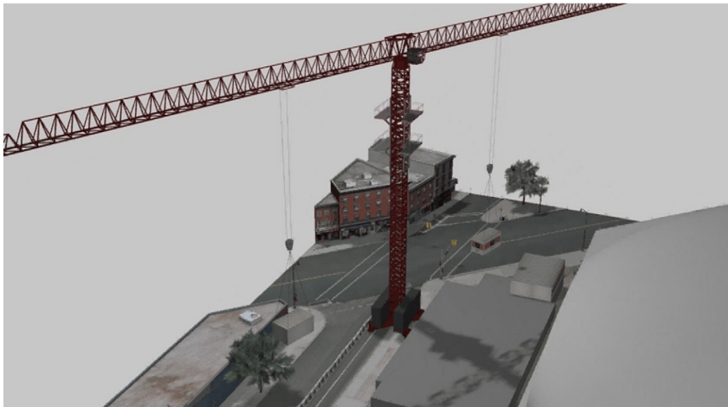
Fig. 2. A double-jib crane operation.

Lift planning and crane selection are receiving considerable attention from practitioners and academics who wish to ensure safety and economy within the workplace. Rodriguez-Ramos and Francis [11] proposed a mathematical prescriptive model to establish the optimal location for a crane in a construction site. Alkass et al. [12] described a methodology for crane selection for construction projects. The methodology is incorporated into an integrated computer system capable of advising users on the selection of appropriate cranes for their construction projects. A fuzzy logic approach to selecting the best crane type for a construction task from a list of selected crane types has also been established by Hanna and Lotfallah [13]. Kamat and Martinez [14] demonstrated that process-based simulation could be used to analyze crane operations by modeling the dynamic movement of cranes as well as the interaction between the crane and the lifted material during a given operation. Sawhney and Mund [15] developed a prototype