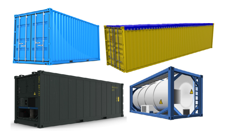
Fig. 1. Examples of container types.

Intermodal containers are characterized by (i) their size (length and height) (ii) their type (iii) their contents and (iv) their weight, filling level and weight distribution. In order to facilitate their handling, sizes are standardized. There are four ISO standard sizes used worldwide: 20 feet high cube, 40 feet low and high cube, 45 feet high cube (the height of low cube containers is 8 feet 6 inches/2.6 meter whereas it is 9 feet 6 inches/2.9 meter for high cubes). This paper focuses on the North American market, where there are two additional sizes of high cubes: 48 feet and 53 feet.