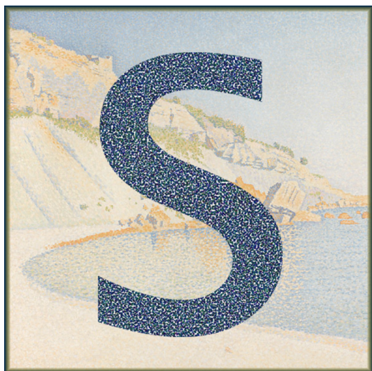
Fig. 1. The Pointillist style was invented by Paul Signac (1863–1935) and Georges Seurat (1859–1891) and describes paintings in which images are composed from collections of individual dots, each containing a single color. This style serves as a metaphor for signac 's data model, in which the data is dependent on both individual data points and their position within the larger parameter space. The painting underlying this artistic illustration Cassis, Cap Lombard was created by Paul Signac in 1889 and is owned by the Gemeentemuseum Den Haag.

This paper is organized as follows. First, the general design principles of signac are presented. We then delve into greater detail about how the core signac functionality is implemented in keeping with these principles, followed by a more in-depth comparison to closely related solutions. Finally, the practicality of this system is demonstrated through numerous examples indicating how signac can be used to manage a variety of disparate, heterogeneous data sets.