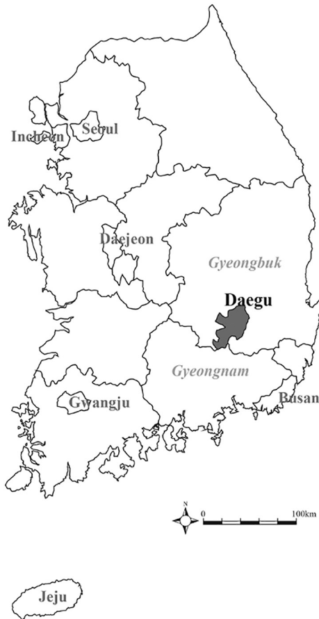
Fig. 1. Location of Daegu.