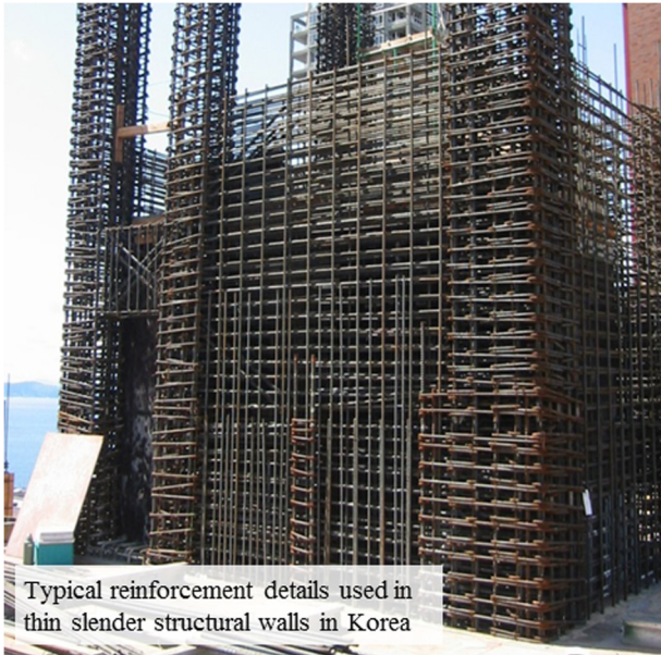
Fig. 1. Reinforcement congestion in thin slender structural walls.

of 200 mm, which were designed based on the guidelines given in KCI 2012 [12]. Fig. 2a presents the reinforcement details as requirement in KCI 2012 [12]; meanwhile, Fig. 2b shows the reinforcement details developed by Chun et al. [13]. In Fig. 2b, the transverse reinforcement composed of U-shaped bars and ties instead of closed hoops and ties in the boundary element of structural walls. In the test on the structural walls with the simplified details, it was found that the walls showed almost the same drift capacity as those of current details according to KCI 2012 [12].