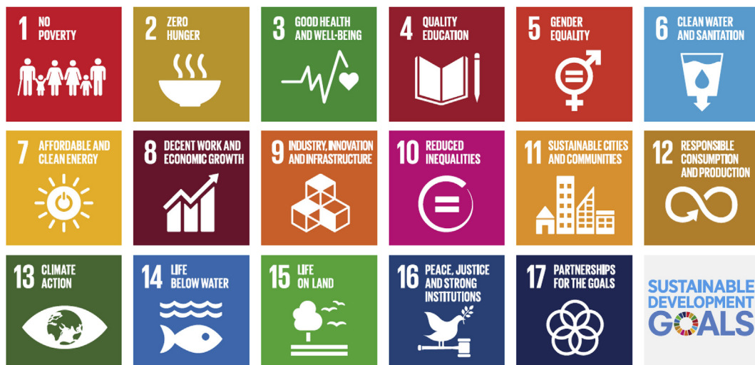
Fig. 1. The Sustainable Development Goals (SDGs).

Building on the Millennium Development Goals set in 2000, 17 SDGs were formally adopted by all 193 member states of the UN in September 2015, aiming at ending extreme poverty, protecting the planet and ensuring prosperity for all by 2030 (UN, 2015). The SDGs expanded the agenda to include issues such as climate change, sustainable consumption, innovation and the importance of peace and justice, requiring all countries to take action, including those with high levels of development (see Fig. 1).