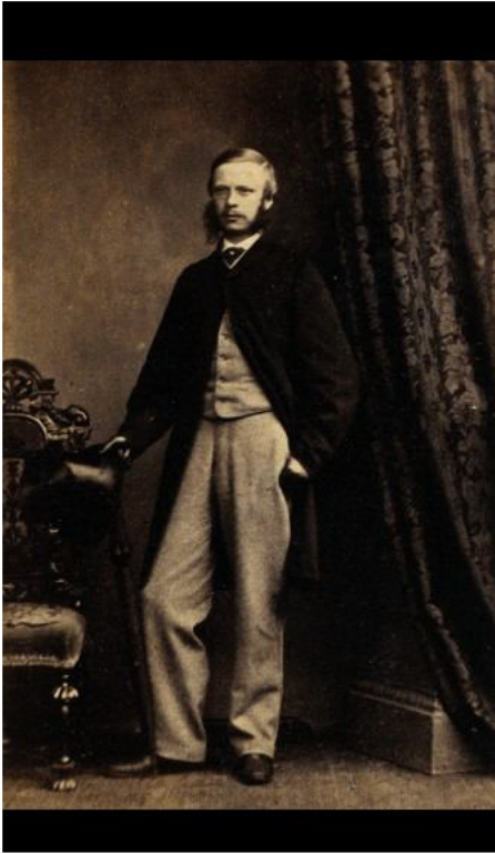
Fig. 1. Sir James Crichton-Browne (1840–1938).

the seizure disorders which occurred in members of four generations of a family (Fig. 2). He seems to have based his account on contacts with members of Generations III and IV.