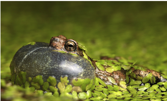
Figure 1. Calling male túngara frog in a pond. The conspicuous inflated vocal sac is clearly visible below the male's mouth.

We performed all experiments at the Smithsonian Tropical Research Institute (STRI) in Gamboa, Republic of Panama. We collected mated pairs of túngara frogs at choruses between 1930 and 2100 hours. After collection, we placed pairs in a light-safe cooler in the laboratory in total darkness for a minimum of 1 h prior to testing to ensure that the female's eyes were dark-adapted.