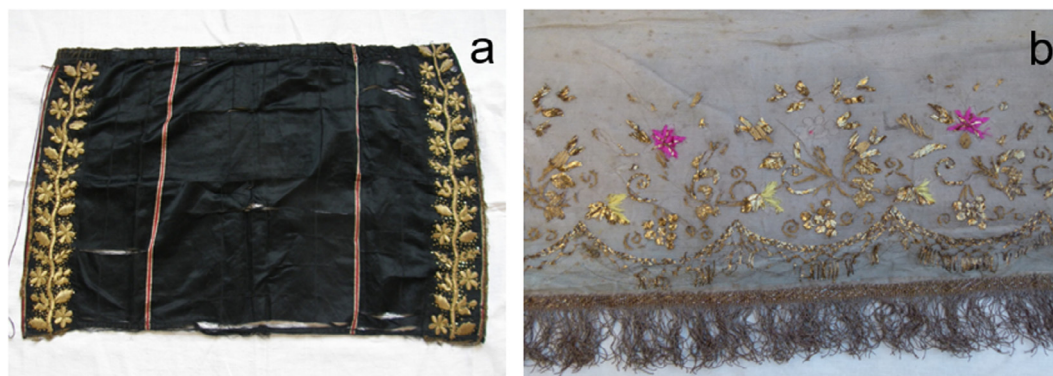
Fig. 1. Historical textile from which some samples of metal threads were taken: a) Folk costume (apron), Osijek, beginning of the 20th century; b) Liturgical vestment (antependium), Novigrad, 19th century.