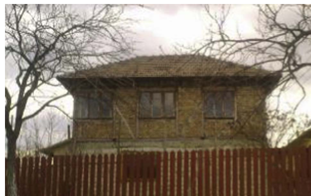
Fig. 2. Traditional infilled timber frame house from Buzau county [4].

validate a proposed evaluation method [14]. In this paper, a part of the project is presented, consisting of a brief summary of the field investigation with a focus on the timber frames with mud brick infills, their construction characteristics and static cyclic tests on two walls, with same characteristics and only difference the position of the diagonal braces.