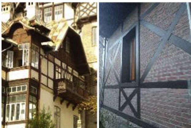
Fig. 1. Old (left) and new (right) "Fachwerk" architecture in Sinaia city, Romania [1].

Due to this reason, in Technical University of Civil Engineering Bucharest, a research project was started – TFMRO project – to evaluate the seismic resistance of traditional residential buildings, in order to