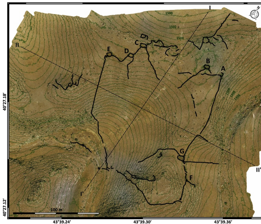
Fig. 2. Orthophoto, height contours, plan and location of two sections of kite UK1.

enclosure, all located in the eastern part of the Armenian kite's distribution range (Gasparyan et al., 2013; Nadel et al., 2015). We sieved in each excavated site several cubic meters of sediment (mostly from the pits; heads, pits and cells are the commonly used terms to describe the relatively small constructed features found at