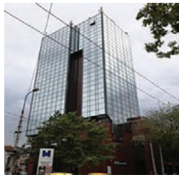
Fig. 1. Office building under study

The office building under study is located in Bucharest. It is a 15-story flat roofed building of 6750m 2 (Figure 1). It is occupied by approximately 600 persons during normal weekday business hours (8/day) all around the year.