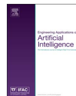
Image feature selection using genetic programming for figure-ground segmentation