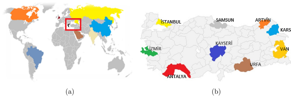
Fig. 1. The World and Turkey cities geographical location.

algorithm program. In one of these studies, a new Gene Expression Programming (GEP) approach is presented for the prediction of the daily solar radiation. The model predicts the daily solar radiation with an acceptable accuracy and outperforms the developed regression-based model [19]. In another study, a physical habitat simulation is presented by using the GEP model and the GEP model results are compared with the ANFIS model results [20]. There are a lot of studies related to the comparison of GEP and artificial neural networks (ANNs), GEP and ANFIS [21–24]. In other studies, GEP was used for function finding [25,26]. Examining the performance of green roof system for a specific geographic area requires a few years of operating time and high cost of open space experimental studies [4,27,28]. In addition, some equations which are developed with experimental studies can be used for determining green roof performance [7,29–31].