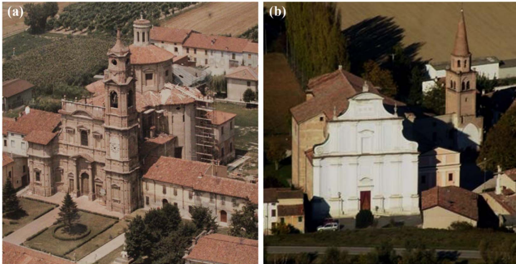
Fig. 1. General view of the two churches under study: (a) Sant'Antonio Abate church in Villa Pasquali; (b) San Erasmo and Agostino church in Governolo.