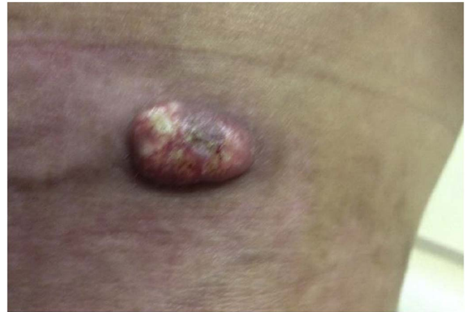
Fig. 3. Left hip lesion in the location of a previous donor site measuring 1 cm \times 2 cm \times 2 cm.