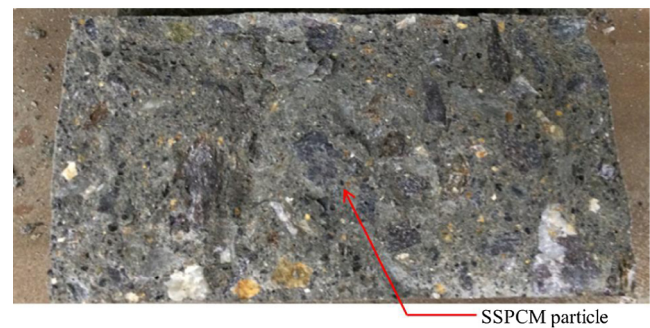
(b) Concrete mixed with SSPCM