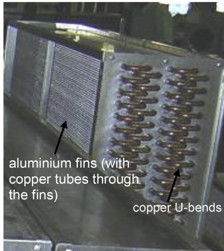
Fig. 1. Air handler coil assembly (AHCA) showing location of fins and U-bends.