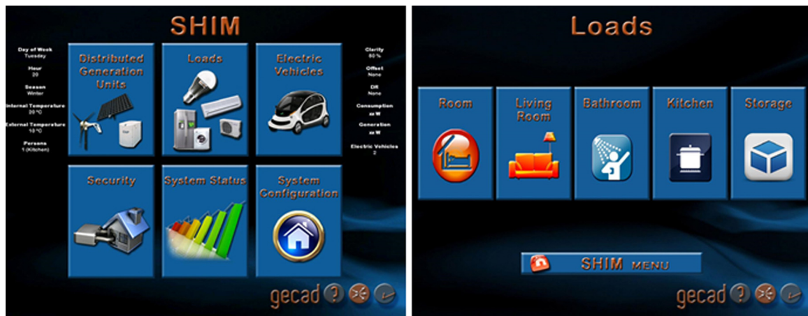
Fig. 1. SHIM user interface.