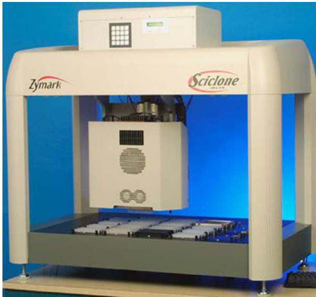
Fig. 1. Sciclone inL10.