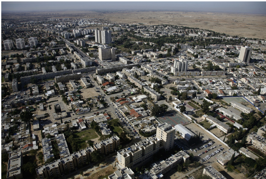
Fig. 2. An aerial photo of Beersheba's inner neighborhoods composed of low-density buildings, with the newer neighborhoods at the outskirts.

This article reviews the major phases of urban planning in Beersheba to highlight the dynamics of national and local initiatives, and their significance to spatial, social, economic and demographic characteristics of the city. Key challenges and future opportunities are explored.