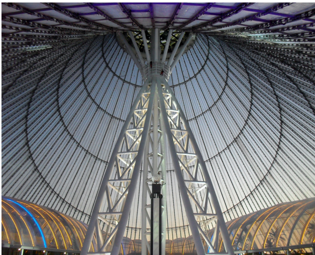
Fig. 2. Foster & Partners, Khan Shatyr Entertainment Center in Astana, Kazakhstan, 2012. An elliptical tent with a 200 m base and 150 m height, with a structure made of steel cables and an envelope of ETFE transparent pneumatic cushions, screen-printed with aluminum powder.

Summer behavior of a test membrane open to the environment was analyzed both experimentally and numerically by He