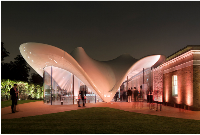
Fig. 1. Zaha Hadid Studio, Serpentine Sackler Gallery, London. Permanent building with double textile membranes roofing system integrated with glazing eyes on the top.

roughly halves, passing from about 6 to 3 W/(m 2 K). Knippers et al. [1] conclude that the choice of the U -value calculation method is not critical, but rather the horizontal/vertical installation of the cushion, determining the direction of the heat flow and thus the natural convection effectiveness. Thermal bridges at the cushion edges, due to the clamping or to the welding, usually increase the heat transfer across the cushion. In order to avoid thermal bridges effect a new generation of pressostatic double layers envelopes has recently been proposed. In this case a gap is created between the two envelopes and an air flow rate is continuously injected into the gap in order to keep the two membranes separated.