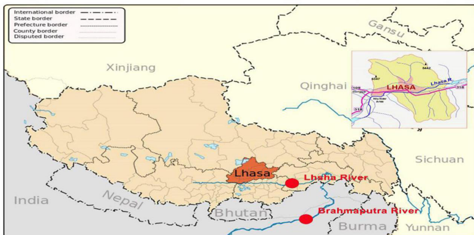
Fig. 2. The map about the location of Lhasa, Lhasa River and Brahmaputra River.

The primary aim of the present work is, therefore, to analysis the climate of Lhasa, where well established strategies could have making good use of the existing natural resources and realize the energy effective or building sustainable.