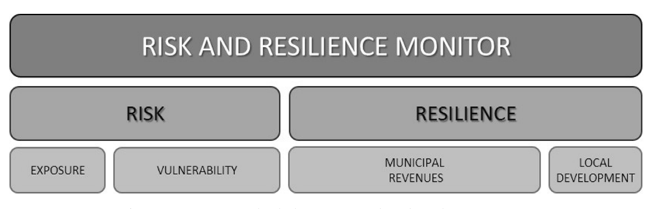
Fig. 1. Dimensions and sub dimensions Risk and Resilience Monitor.

The key characteristic that entities subjected to risk must have is resilience. In 2016, the Chilean Commission for Resilience to Disasters of Natural Origin defined resilience as "the capacities of a system, person, community or country exposed to a threat of natural origin, to anticipate, resist, absorb, adapt and recover from its effects in a timely and effective manner, to achieve the preservation, restoration and improvement of its structures, basic functions and identity" (National Council for Innovation for Development, 2016, p. 5). This definition can be seen as quite traditional within disaster risk management due to its