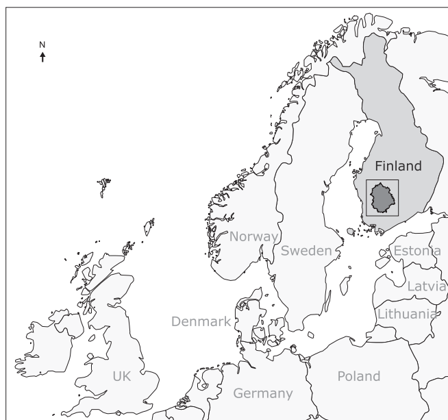
Fig. 1. Location of the study area in the context of Northern Europe.

The study area covers the Tampere administrative region (Finnish: Pirkanmaa , Fig. 1) with an area of circa 14 600 km 2 , of which 5% is urban, 11% agroecosystems, 69% forests or forestry lands, 1% wetland and 14% inland watercourses according to CORINE Land Cover (CLC) 2012 data (Fig. 2). The region and the spatial configuration of its ES supply are heavily characterized by being located in the intersection of different "landscape regions" – the region's southwestern–western parts being agricultural lowland, central and eastern parts a mosaic of forest, lakes and agricultural land, and the northern parts being dominantly forested and host to the region's most wetlands – due to being located on the highlands of a major drainage divide ( Suomenselkä ). Most of the region is situated on the western frontier of the so-called Finnish Lakeland – a geographical region characterized by a multitude of lakes and mosaic-like landscapes. Similarly pivotal geomorphological features from the ES perspective are the numerous eskers crisscrossing the region. Almost the entire study area is situated within the Kokemäenjoki ( Kokemäki River ) drainage basin (of which in turn most is located in the region), named after a major river traversing