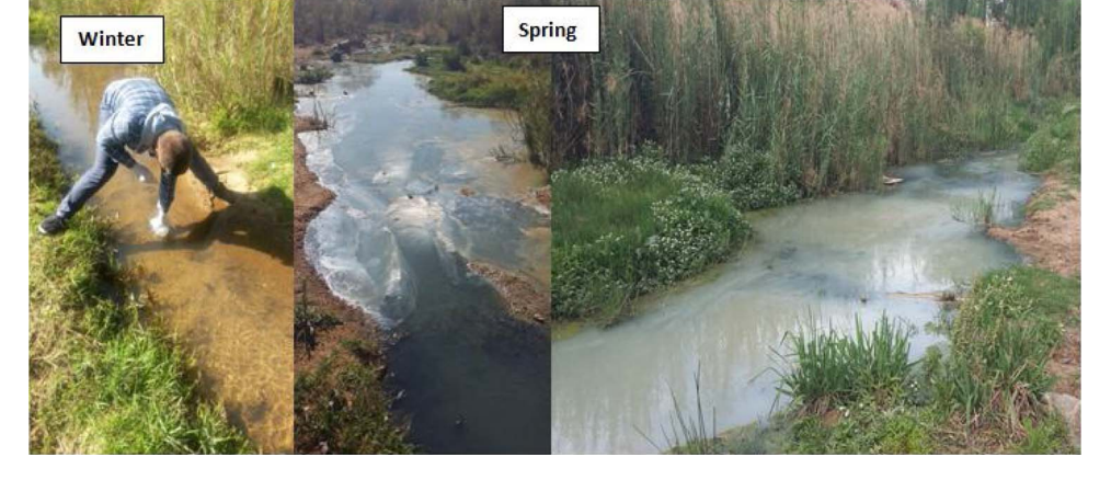
Fig. 1. Change in physical quality of the water within the tributaries due to industrial discharge.

Sites one to six were all located on the two selected tributaries while sites seven and eight were on the main Klein Jukskei River, upstream and downstream from the points where the tributaries entered the river. A total of 192 triplicate samples were collected during the entire study.